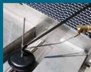
Float valve & ball assemblies