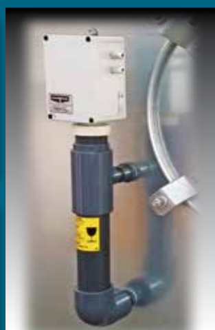
Electric Water Level Control