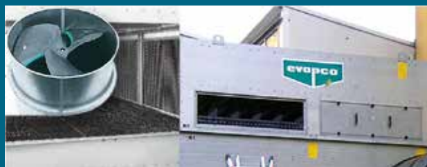
Unit sound attenuation