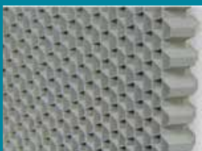
WST Air Inlet Louvers