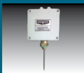
Low Water Cut Off