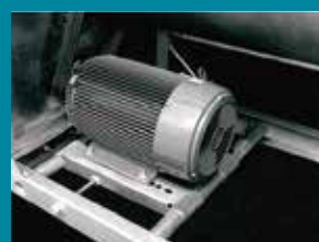
Motors & Pumps