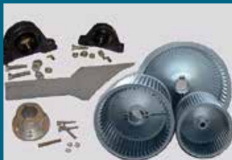
Components for axial and centrifugal fan groups