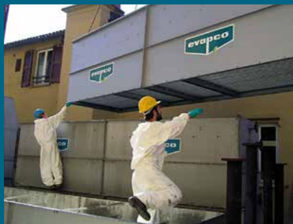
Complete section replacement