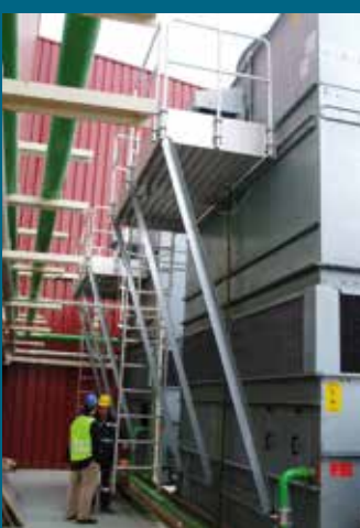
Ladder & Platform Installation