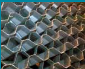
EVAPAK® Deck Fill